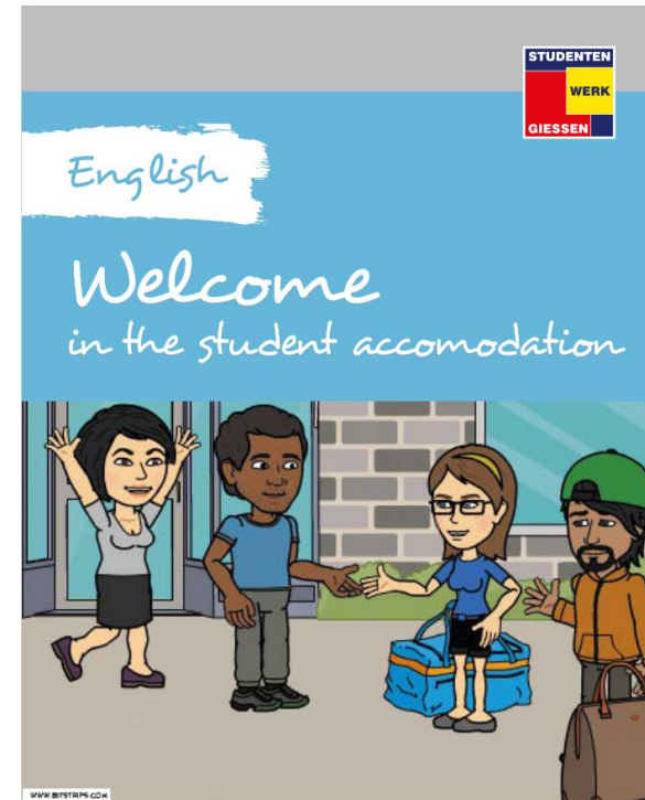
Information brochure for Giessen, Friedberg & Fulda

Sources: https://www.stwgi.de/assets/public/WOHNEN/DOWNLOADS_PDFS/STWGI_Wohnheimbroschuere_Deutsch.pdf (left) https://www.stwgi.de/assets/public/WOHNEN/DOWNLOADS_PDFS/Wohnheim-Broschuere_englisch_2021-11.pdf (right)